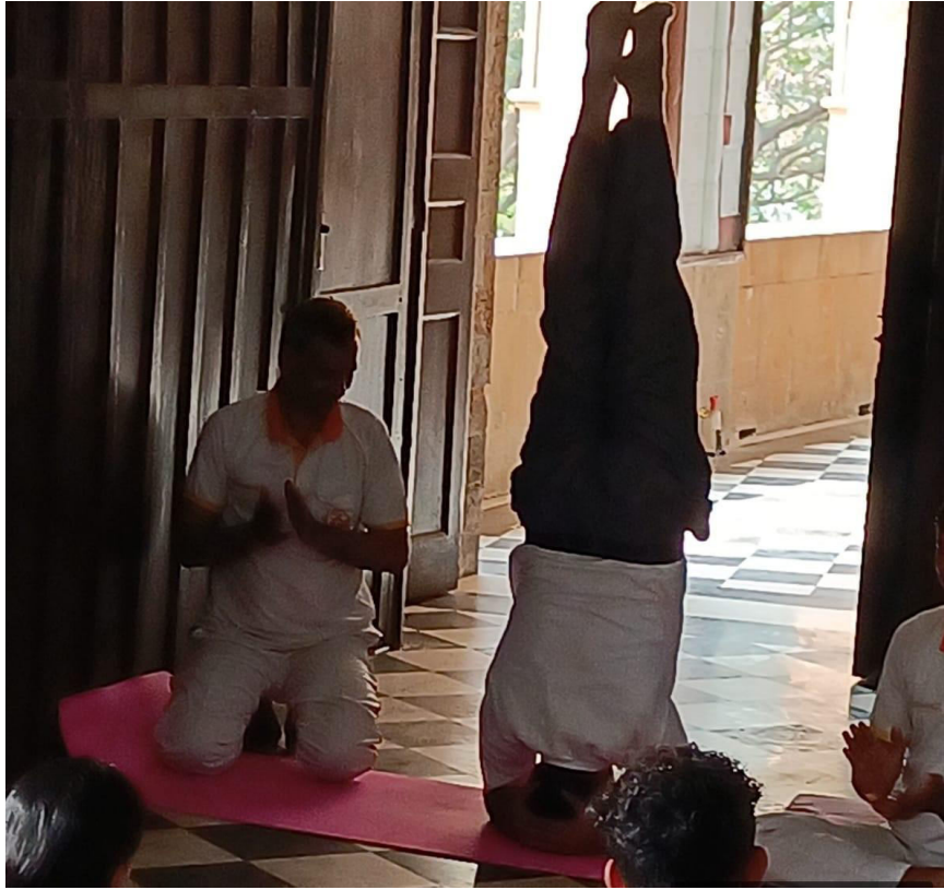
Yoga Session in progress